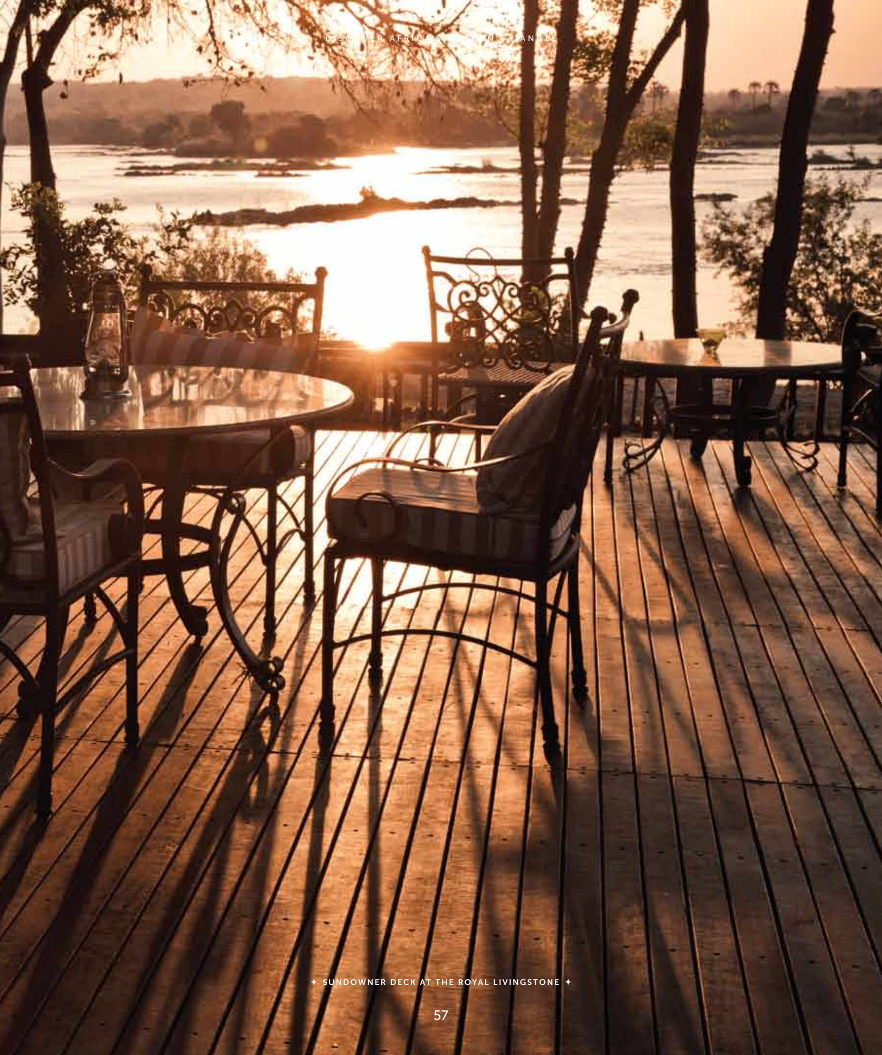
✦ SUNDOWNER DECK AT THE ROYAL LIVINGSTONE ✦