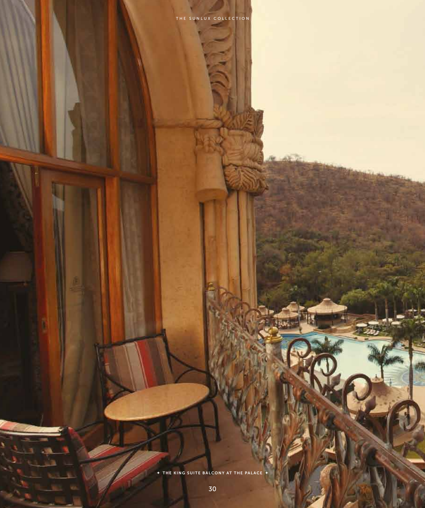
✦ THE KING SUITE BALCONY AT THE PALACE ✦