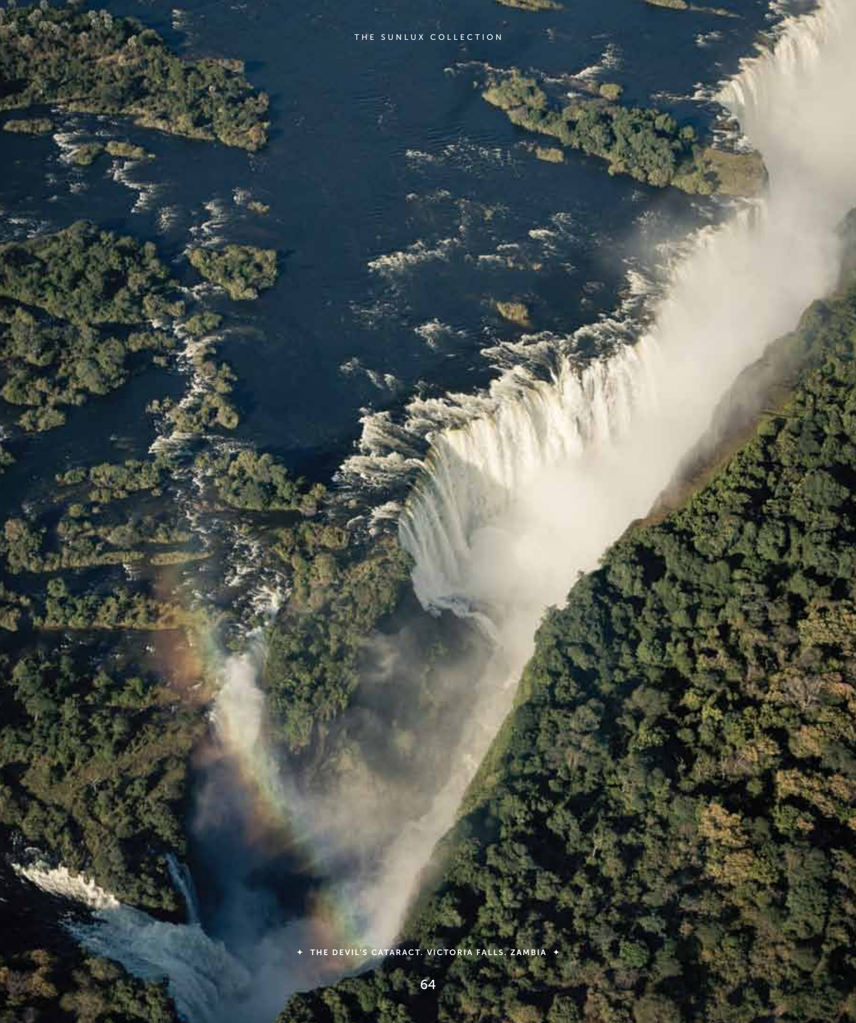
✦ THE DEVIL'S CATARACT. VICTORIA FALLS. ZAMBIA ✦