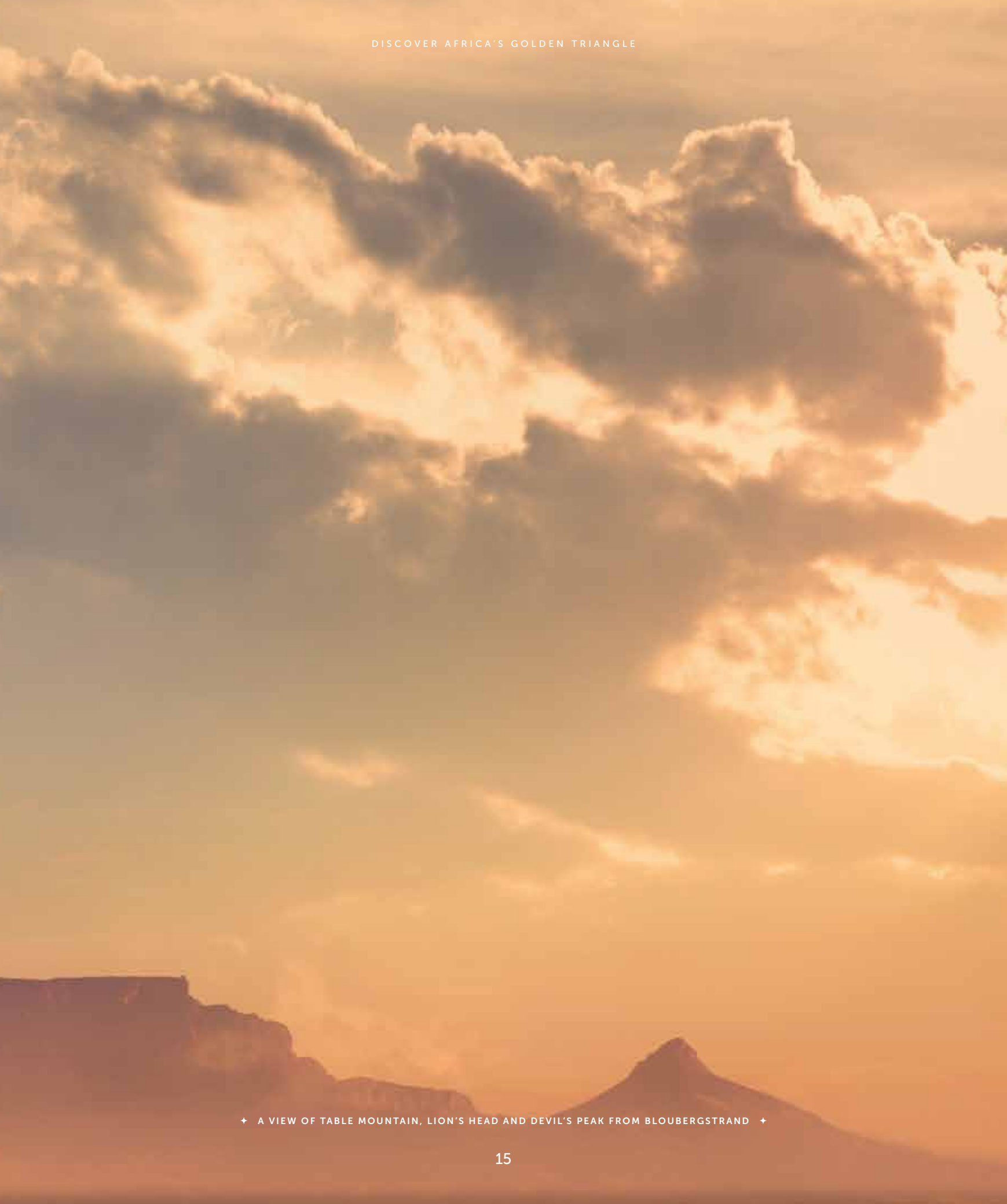
✦ A VIEW OF TABLE MOUNTAIN, LION'S HEAD AND DEVIL'S PEAK FROM BLOUBERGSTRAND ✦