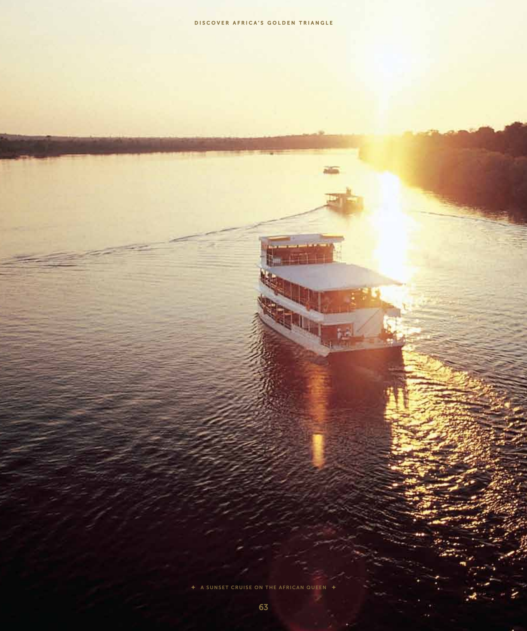
✦ A SUNSET CRUISE ON THE AFRICAN QUEEN ✦