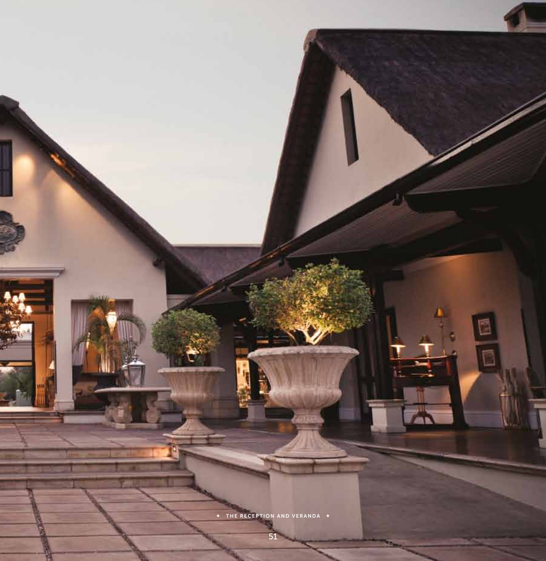
✦ THE RECEPTION AND VERANDA ✦