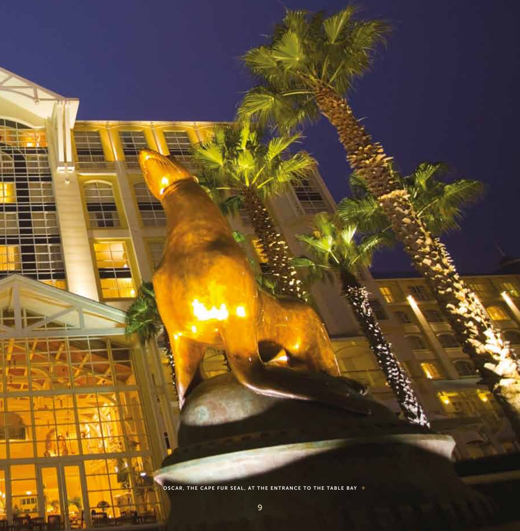
OSCAR, THE CAPE FUR SEAL, AT THE ENTRANCE TO THE TABLE BAY ✦