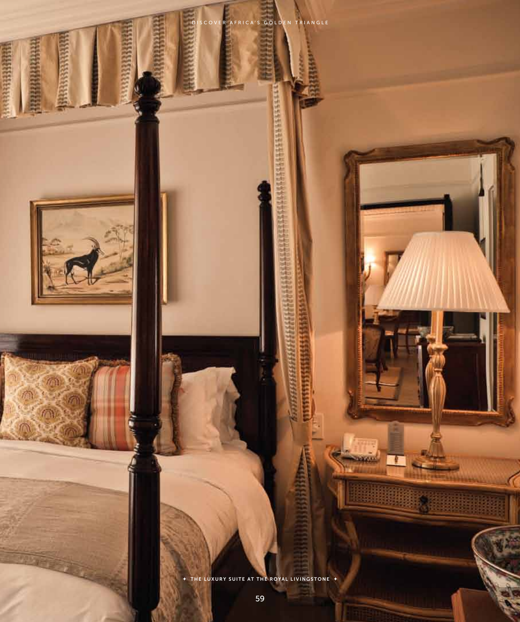
✦ THE LUXURY SUITE AT THE ROYAL LIVINGSTONE ✦