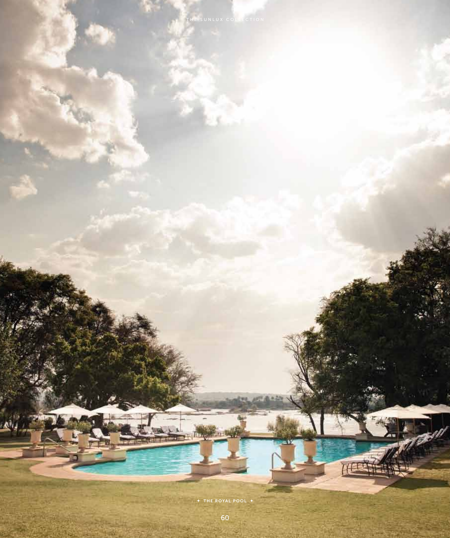
✦ THE ROYAL POOL ✦