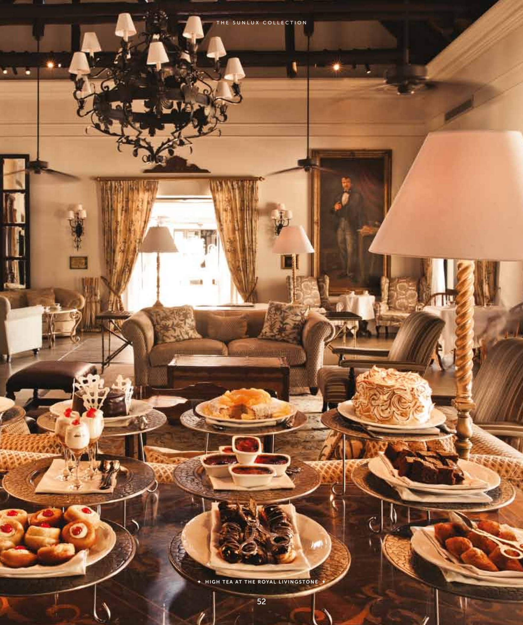
✦ HIGH TEA AT THE ROYAL LIVINGSTONE ✦