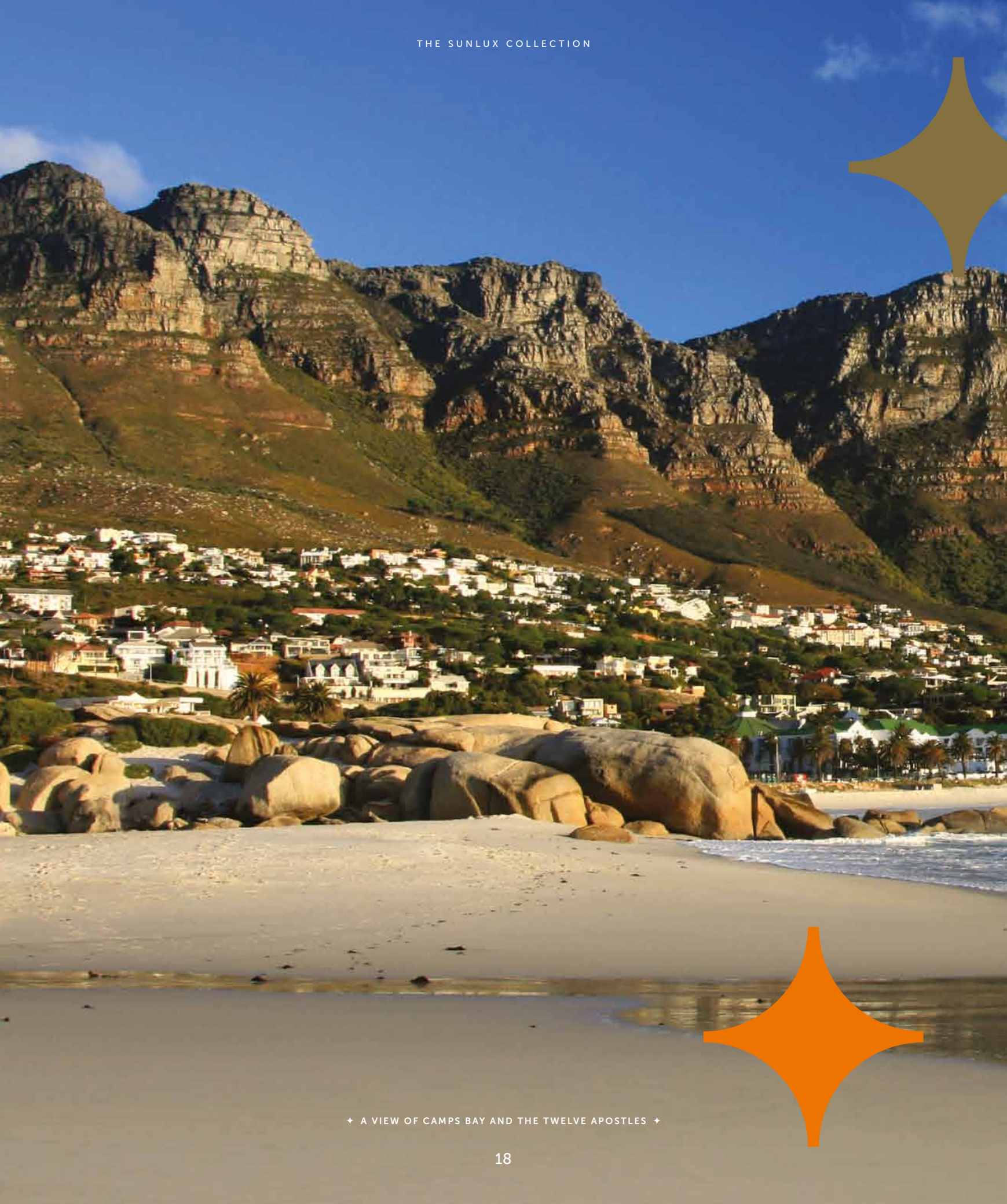
✦ A VIEW OF CAMPS BAY AND THE TWELVE APOSTLES ✦