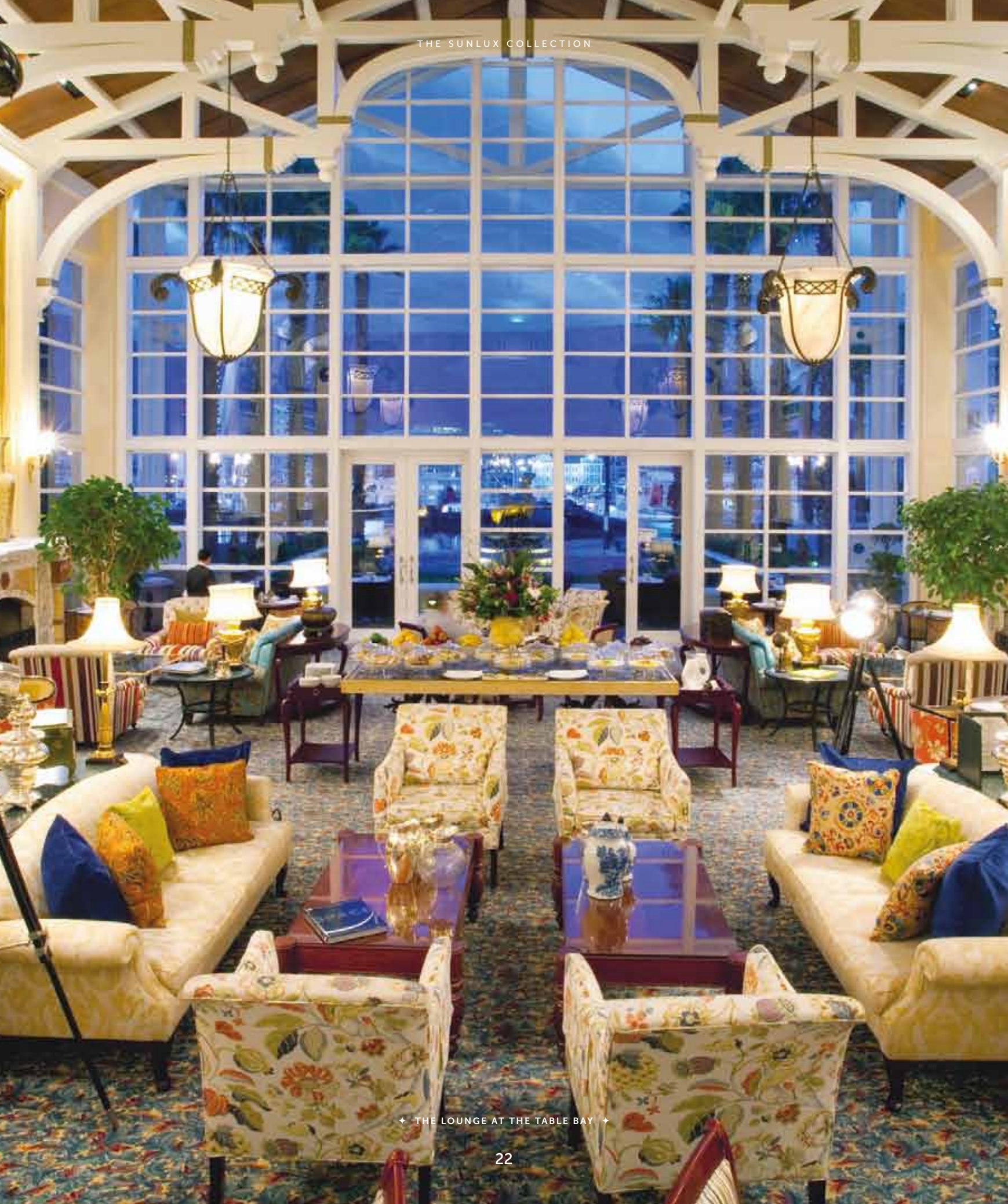
← THE LOUNGE AT THE TABLE BAY →