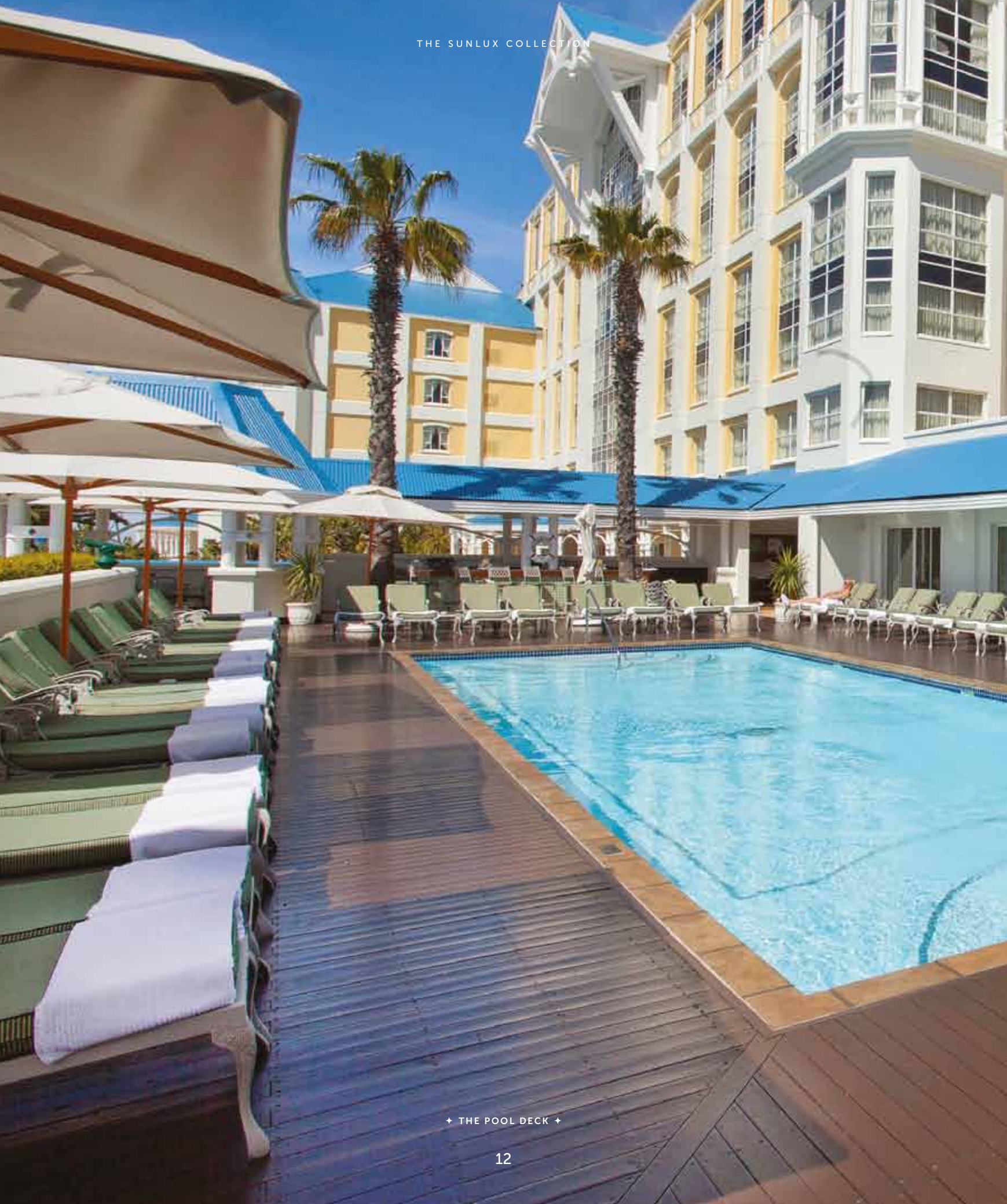
✦ THE POOL DECK ✦