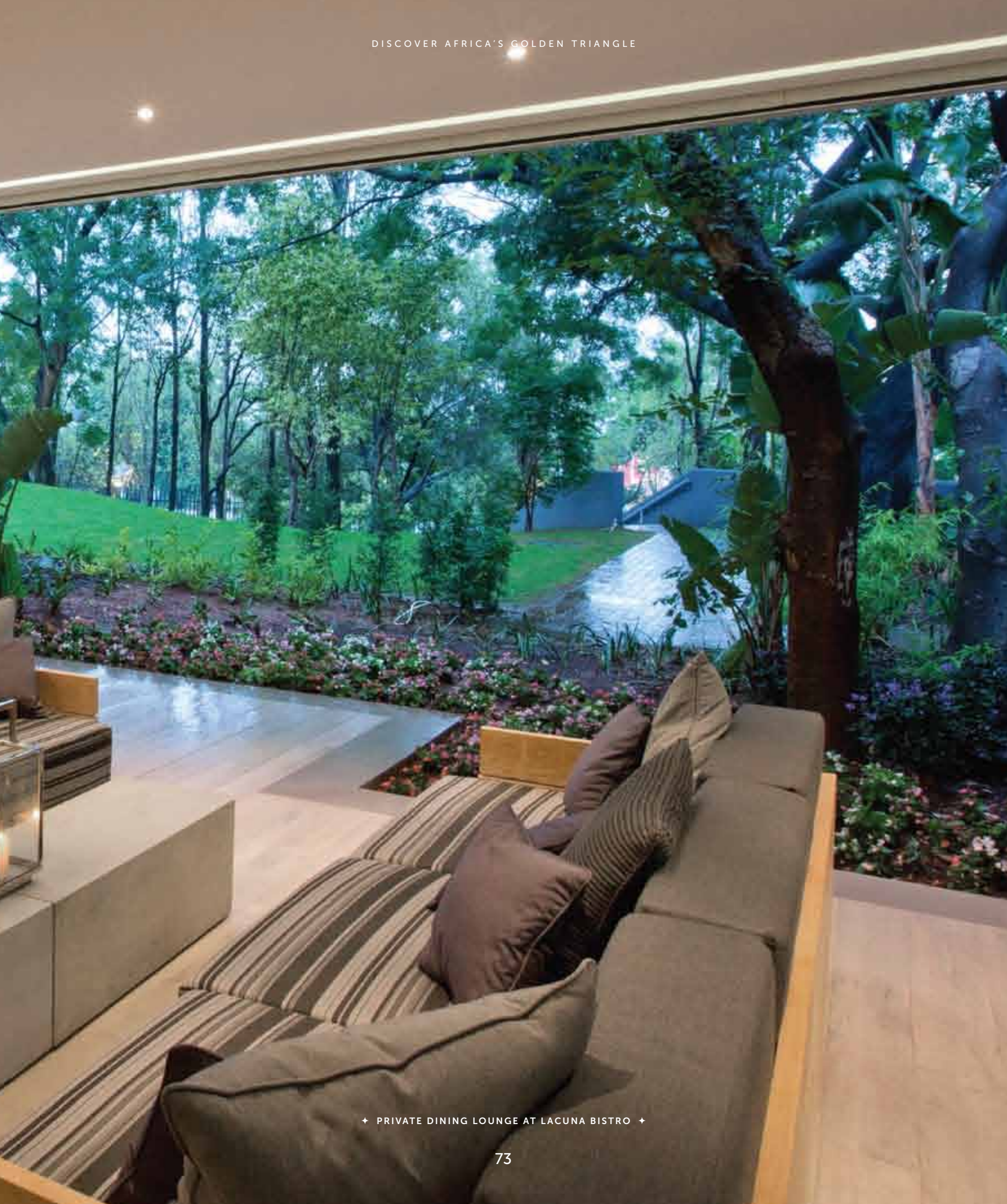
✦ PRIVATE DINING LOUNGE AT LACUNA BISTRO ✦